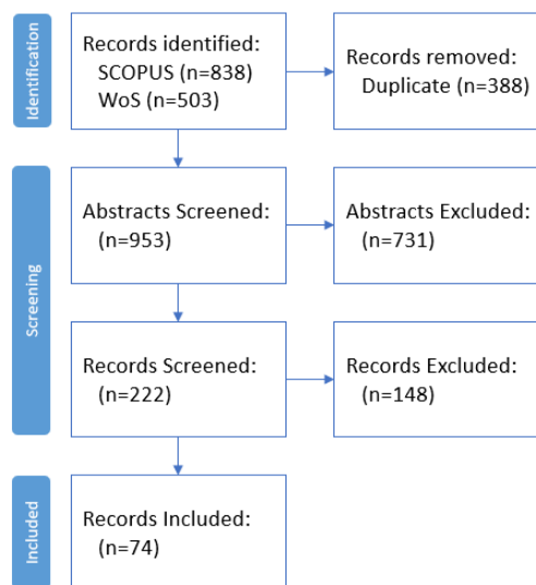
Figure 1: Document Flow Diagram

The results were included if they were full-length articles, published in a peer-reviewed source, and written in English. This was followed by two rounds of screening, the first one based on the abstracts and the second on full text for those that were unclear from the first screening. To be included, the publication had to be implemented in an educational setting, where the learning sequences refer to an ordered series of actions during a learning task. Non-empirical works are excluded, as are works that only mention education as part of the institution name or a possible use case. Additionally, publications were excluded if they analysed unrelated sequencing,