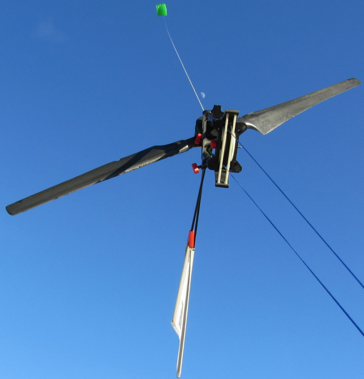
Kiwee One airborne wind turbine with 1 m rotor diameter (1 July 2017)