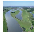
flood plain Nederrijn, NL