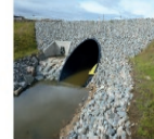
culvert Lossie River, SL

3 Economical: modal split to incentivate public transport and cycling, reduction of emissions and mitigation of the effects of the interruption of arterial highways. Impulse of railway transport from the port of Durres.