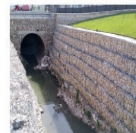
gabion wall Limuthi river, AL