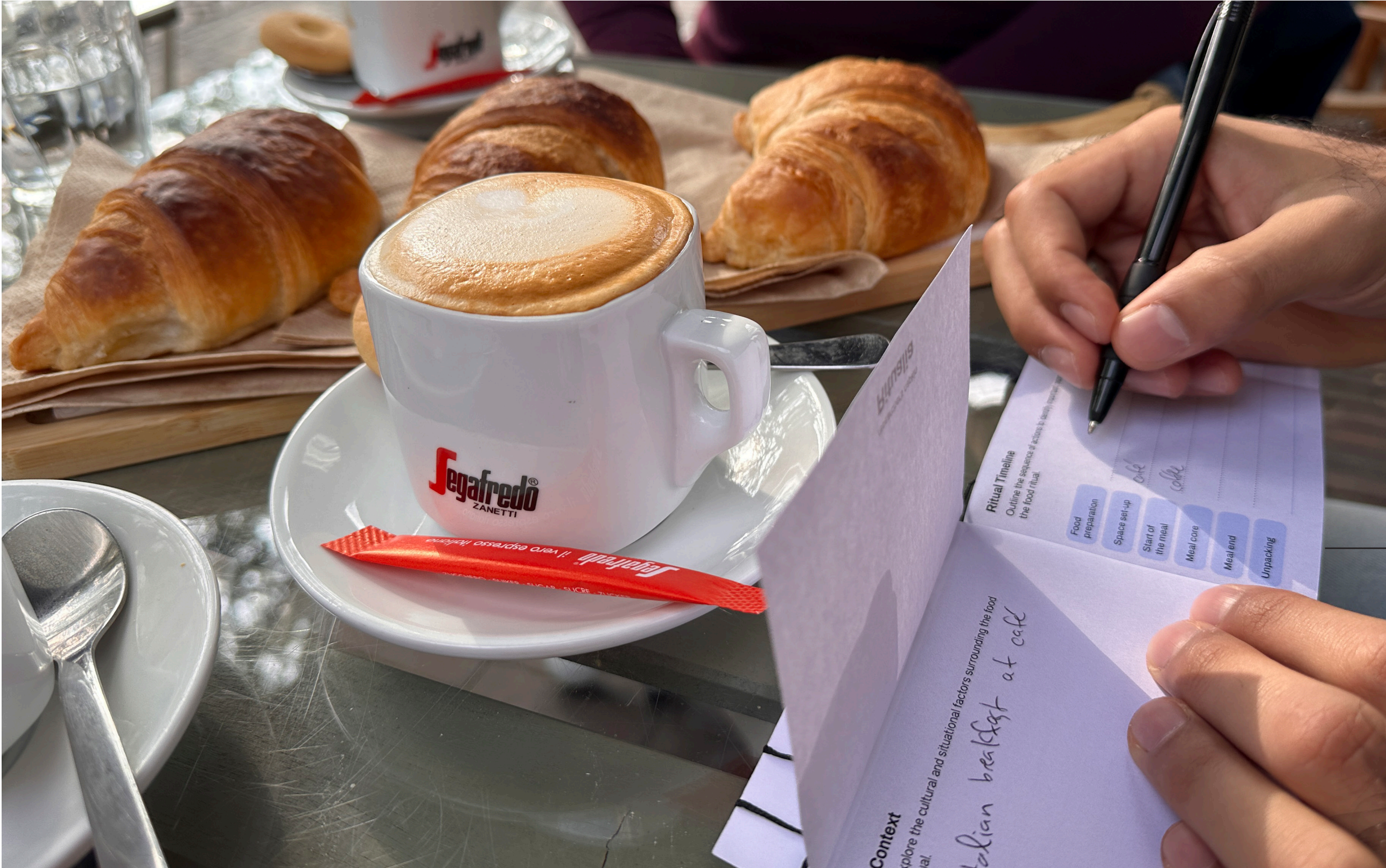
The researcher's napkin , an ethnographic tool, supporting the observer in the ritual analysis of a breakfast context.

How? The napkin serves as a valuable observational tool during the exploration of rituals, facilitating the definition phase of the research by capturing contextual elements, gestures, artifacts, and language triggers within multicultural food practices. Where? The napkin can be utilized in a wide range of contexts, including homes, restaurants, communal spaces, and cultural events.