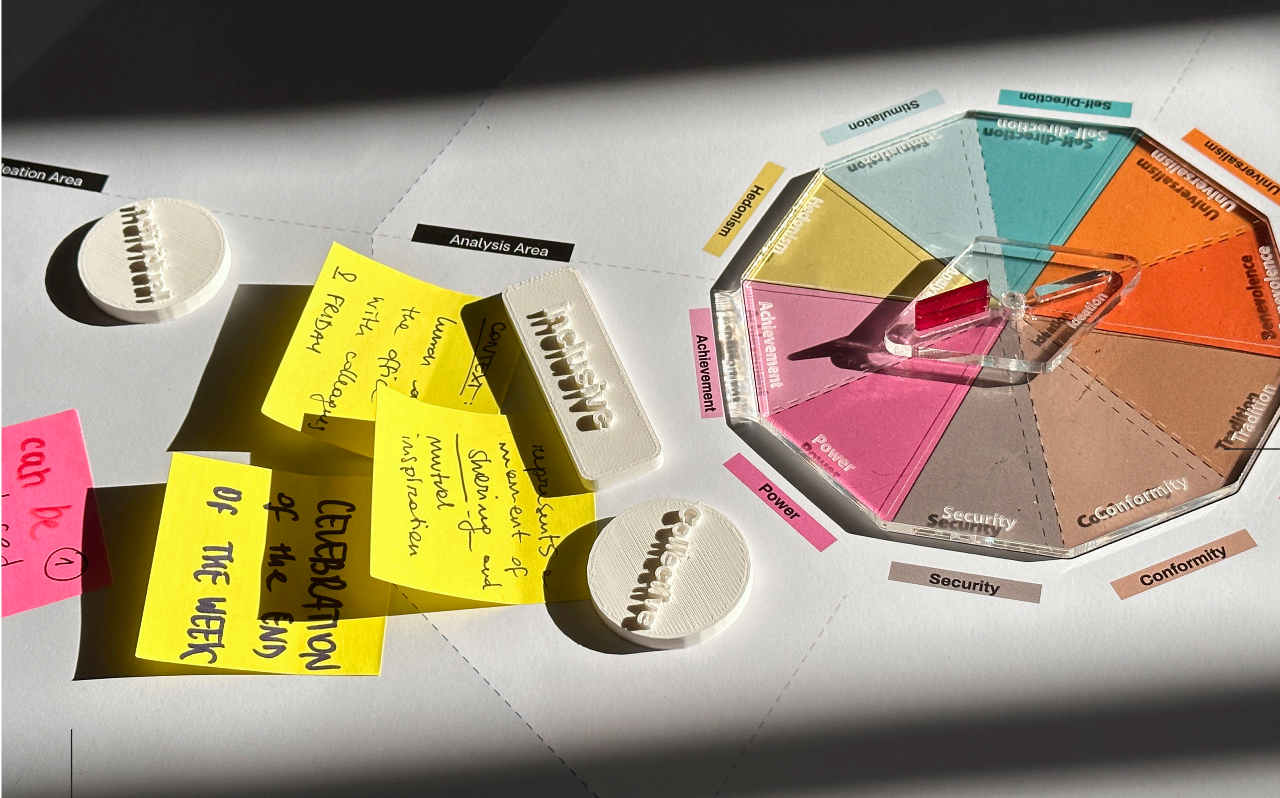
The value compass and map being used by the user to analyse the chosen food ritual.

By relying on the basic human values framework developed by Schwartz, the toolkit facilitates the analysis and ideation process by providing a visual tool to foster designers' criticism of how cultural values intersect with food rituals, guiding them to generate design concepts in the developing phase of ritual exploration. When? The value map and compass ecosystem can be used in both individual ideation and team collaboration settings, whether at home or in a professional work environment. Its versatility makes it adaptable to various scenarios.