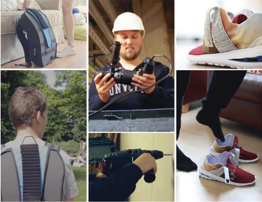
Fig. 3.2 Image showing Pat the social backpack (left), Harry the power drill (middle) and Waggle the shoe (right)