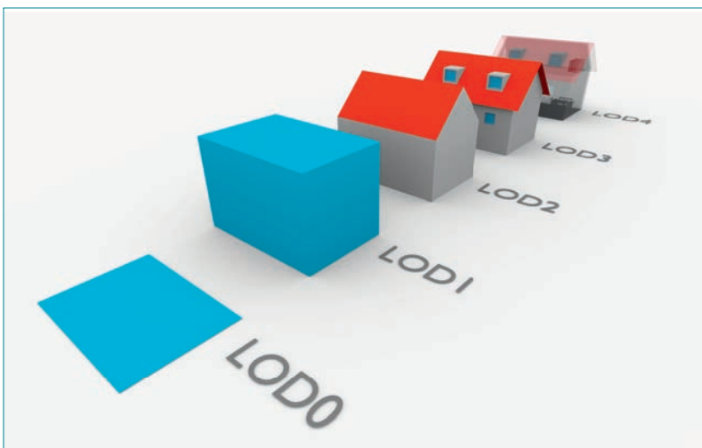
▲ Figure 1, The concept of five LODs as defined by CityGML.

Cities are increasingly adopting 3D city models for 3D visualisation, computing solar panel potential of roofs, and other applications. In a similar way to traditional maps, 3D models are an abstraction of the real world: certain elements are simplified or omitted. The amount of detail that is captured in a 3D model, both in terms of geometry and attributes, is collectively referred to as the level of detail (LOD). The CityGML standard from OGC defines five different LODs, but the specification is not very precise. In this article, the authors propose an improved specification for defining the level of detail in a 3D city model.