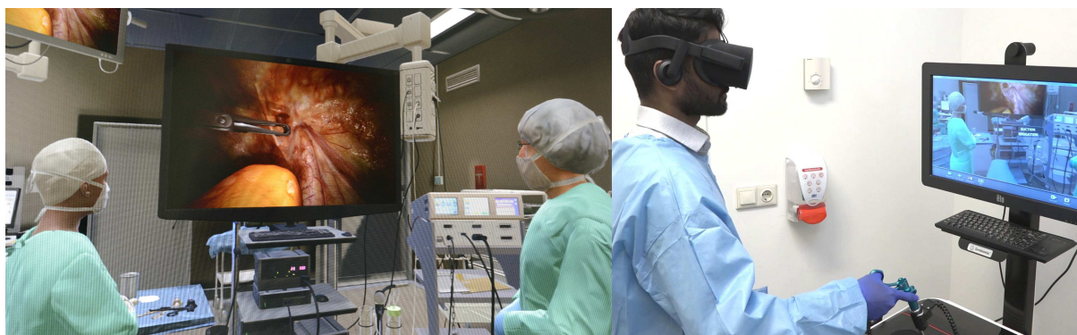
Figure 1: The concept of a virtual reality operating room

Jeroen Ponten‡ Catharina Hospital Jack Jakimowicz|| TU Delft IDE Catharina Hospital