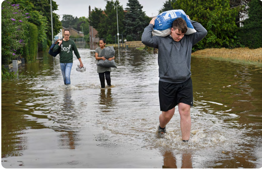
Inhabitants are evacuating from the flooded area in Limburg.

in the Netherlands, also because of the greater precipitation amounts and the steeper – faster flowing – rivers.