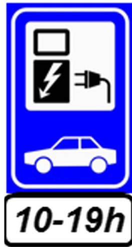
Fig. 2. Street sign to indicate that parking spot is exclusively reserved for charging vehicles between 10:00 and 19:00.