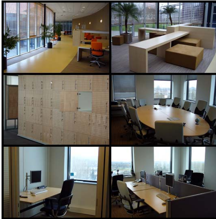
Figure 1: Impression of the design at organization X

Organization X is a regional office of a Dutch governmental organization. In June 2007 organization X moved into a new building with a non-territorial workplace concept with a modern design, of which an impression is given in figure 1.