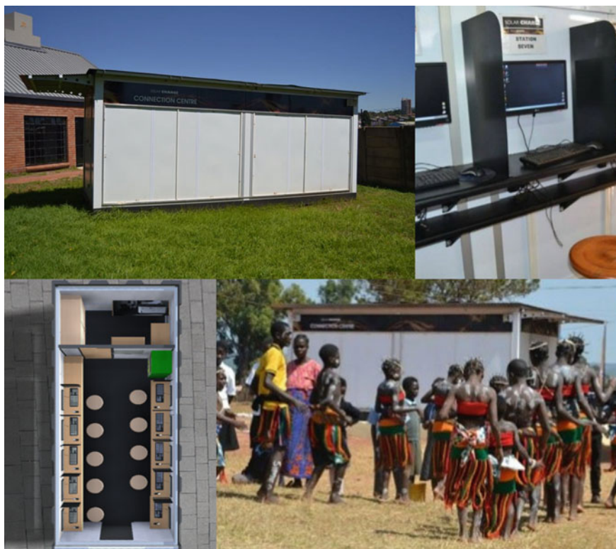
Fig. 6.6 Solar-Powered Café, South Africa. Source www.kutengatechnology.com