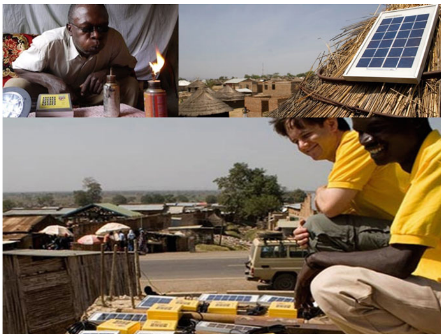
Fig. 6.2 Indigo, Sub-Saharan Africa.

First, the list of criteria is provided. Consequently, each criterion and related guideline is exemplified through case studies.