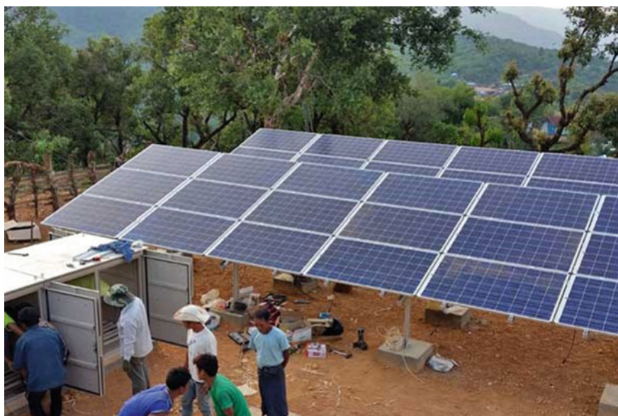
Fig. 6.4 Sunlabob, Laos.