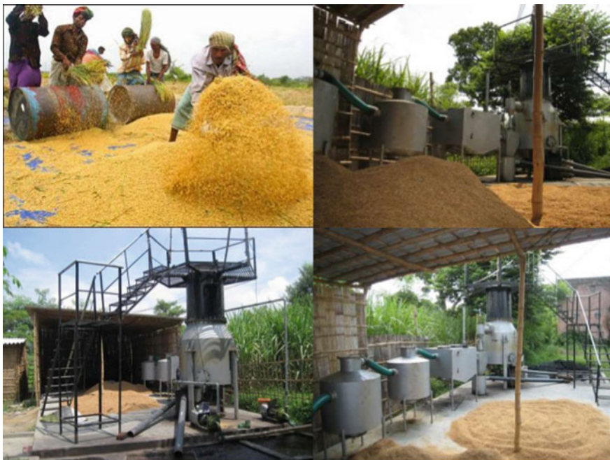
Fig. 6.5 Husk Power Systems, India.