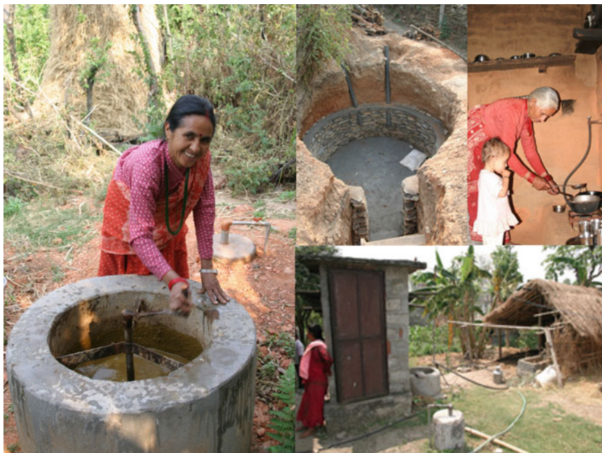
Fig. 6.7 Domestic Biogas, Nepal.