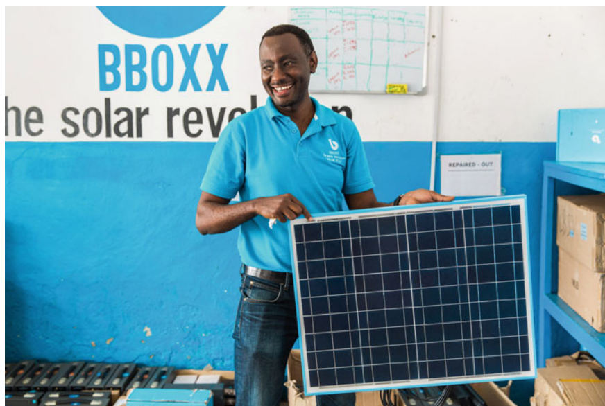
Fig. 6.3 Bboxx, Africa and Asia.