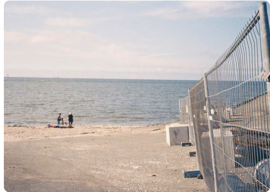
Figure 2: Family swimming in the Wadden Sea, Eemshaven, August 2021.

The research explores the possibility to further demonstrate that flood defence infrastructures can be developed within a spatial approach. We recognised that flood defences are physical manufactures integrated into the urban landscape that impact urban development and the way