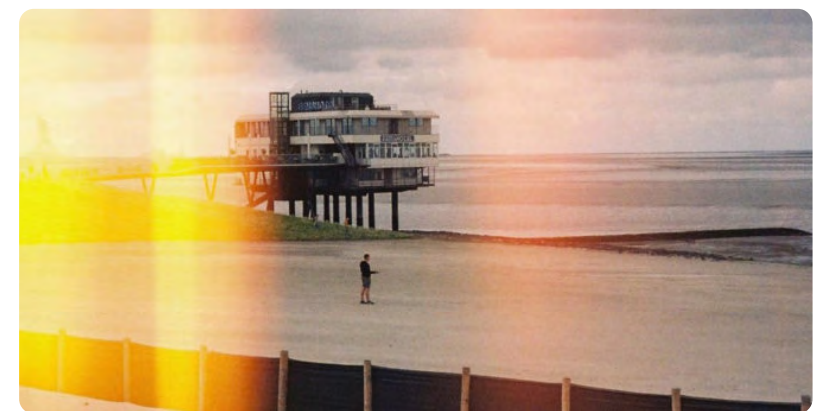
Figure 1: Ems bay seen from Delfzijl beach, Dutch Wadden Sea.