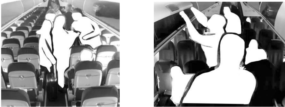
Figure 1. Left: aisle interference where one passenger allows another to pass (social). Right: aisle interference where a passenger blocks the aisle (anti-social).

Additional handling (second interference) is sometimes needed for luggage storage. This could be prevented by improved preparation. Travelers sometimes stow their hand luggage at a 90-degree angle, which occupies more space in the overhead lockers. This may lead to additional aisle blocking when the flight attendant intervenes to position it correctly. Passengers may also block the aisle when stowing their jackets or retrieving things for use during the flight (e.g., a book or a laptop) from their stowed hand luggage. If the overhead lockers are full, flight attendants may remove the jackets and small bags and ask passengers to stow them underneath the seat in front of them. Our observations revealed this practice to be a source of discussion or even irritation among passengers. Ultimately, there is not enough space for hand luggage in the overhead lockers. Extra work is thus required by the flight attendants to place the bags on wheels away from the seat, as mentioned by Marelli et al. (1998). Sometimes passengers have difficulties in finding their seat, as the seat numbers are small and difficult to make out. This causes people to slow down or take the wrong seat, blocking the aisle and row when the error is discovered, and they are re-seated.