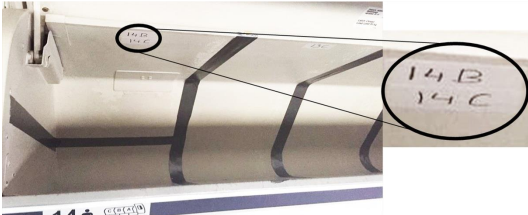
Figure. 2. An example of a number indicating where the hand luggage should be stowed. In this case, two pieces should be stowed on top of one another.