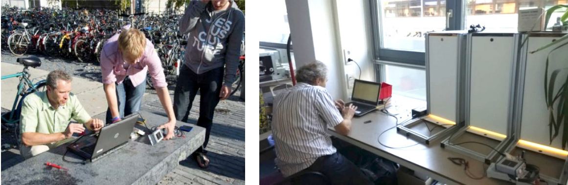
Figure 3: PV test outside, and the laboratory test using closed PV-test cabinets.

To assess if the potential harvestable power and the power production of the PV cells matches a realistic use scenario, the students are given the task to disassemble the product, measure the solar cell characteristics and determine the power and energy consumption of the product's function. Furthermore the students have to identify all components and draw up an electronic schematic (Brain 2012) which shows the interlinked connection between the power consumer (the product's main function), the intermediate accumulator (battery) and the power producer (PV cells), Figure 4.