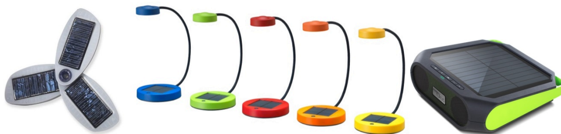
Figure 1: Examples of solar products used in the practicum: the Solio solar powered charger (Solio 2015), the IKEA Sunnan solar lamp (IKEA 2014) and the ETON Rugged rukus Bluetooth speaker (Eton 2014).

Students work in teams of 4 to 5 people. At the end of the ten week course the teams have to deliver a report and poster presentation. Together these two deliverables constitute the final grade.