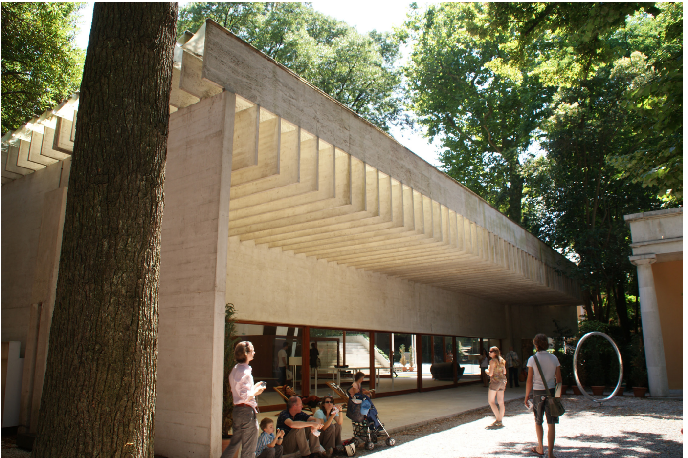
Fig. 7 | Nordic Pavilion: texture through construction, thin beams, material, diffuse light.