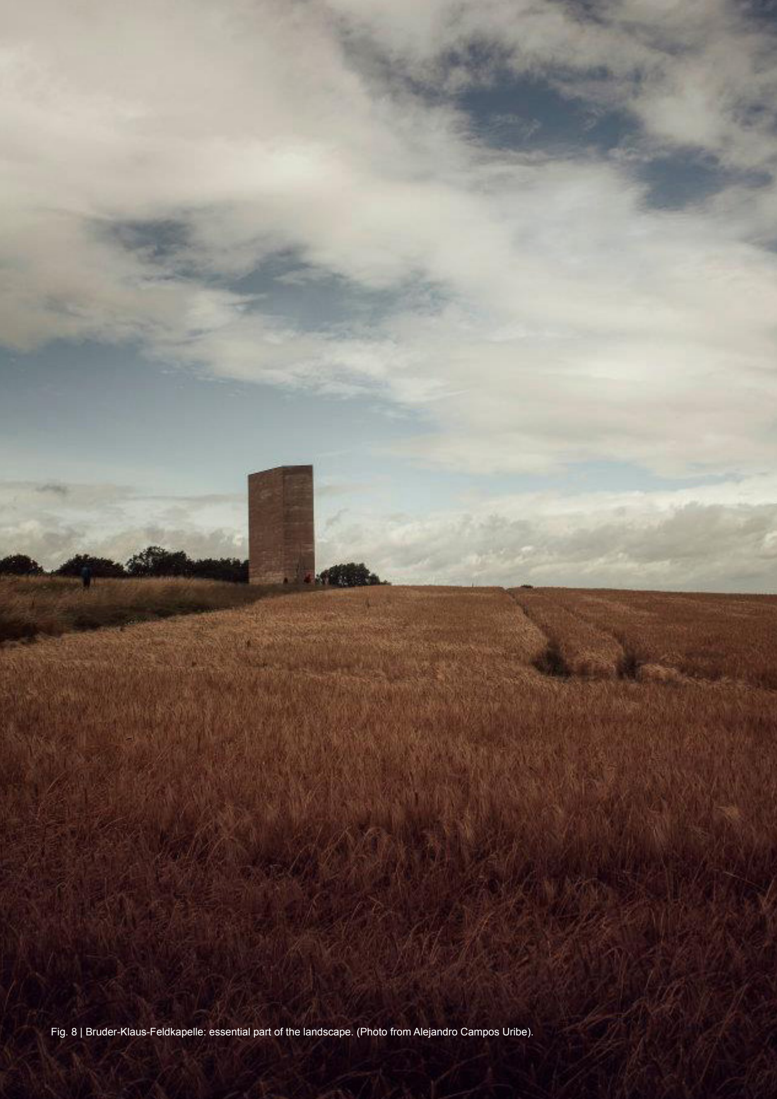
Fig. 8 | Bruder-Klaus-Feldkapelle: essential part of the landscape.