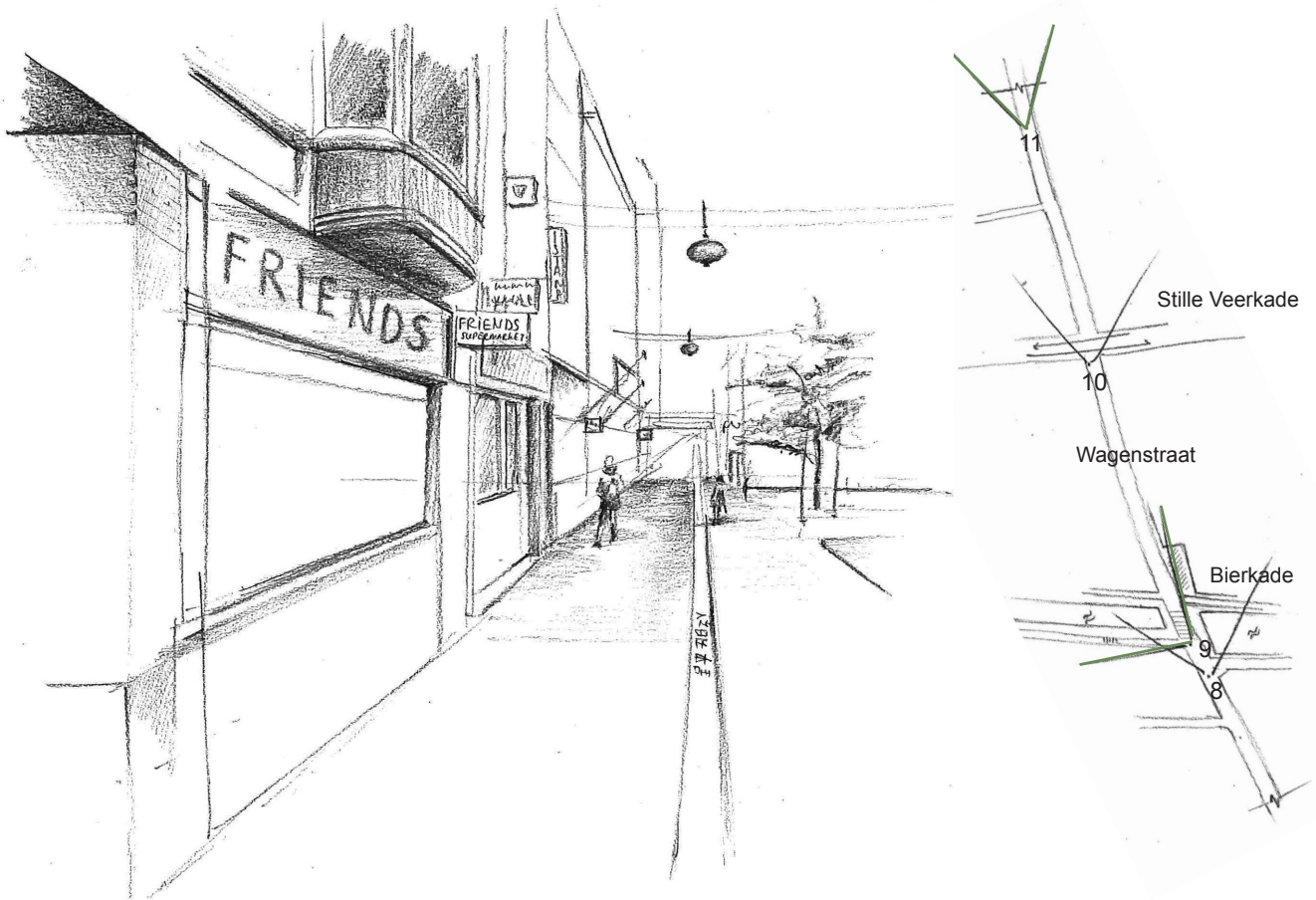
Fig. 6 | Drawing 11: 300 meter further in the street: Chinatown's many small shops and shop signs.