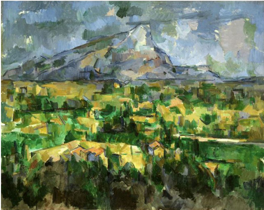
Fig. 4 | 1902 Mont Sainte-Victoire, oil on canvas. Paul Cézanne.