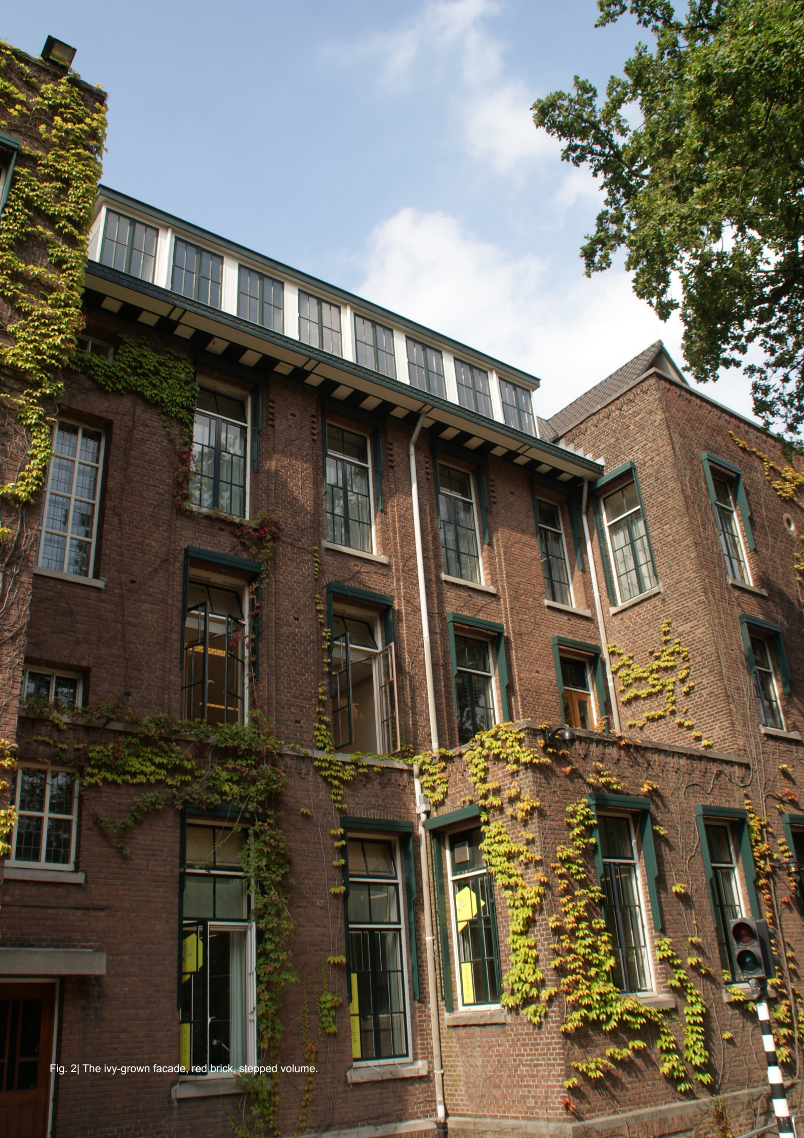
Fig. 2| The ivy-grown facade, red brick, stepped volume.