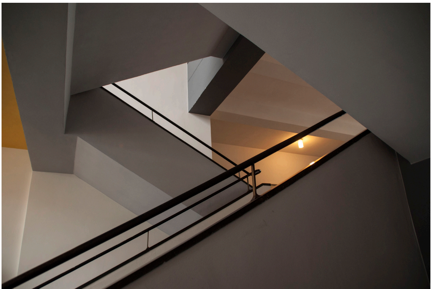
Fig. 8 | Bauhaus: subtle application of colour, changing light, care for detail.