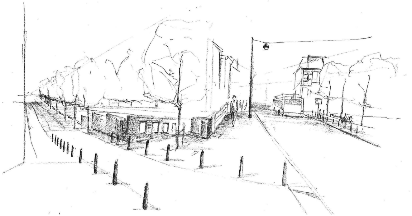
Fig. 5 | Drawing 9 from the sequence, taken from the Bierkade: far view into the street, line of trees.