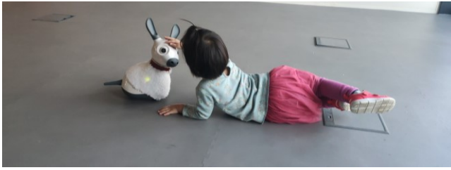
Figure 2: Participant Interacting with MiRo-E Robot

interactions. Moving, feeling, thinking, observing, speaking, and hearing are the six senses implemented in the robot.