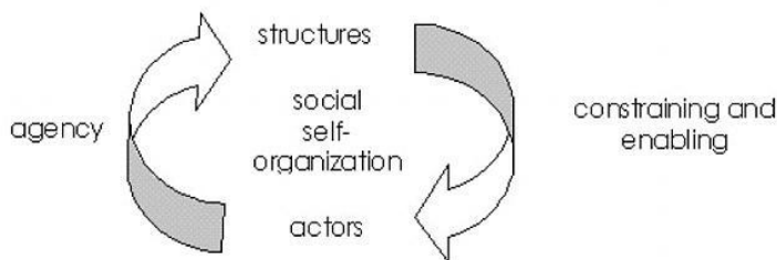
Fig 1. Self-organization of Social Systems (Fuchs, 2003, 6)

Zellner, Hoch, and Eric Welch (2012, 41) also support this idea by arguing that Interactions among large number of components in complex systems foster the systems' self-organization capability and make the systems adaptable to the changes. However, these interactions may also lead to unpredictability of its behavior. Giddens (1984, 2) also emphasizes