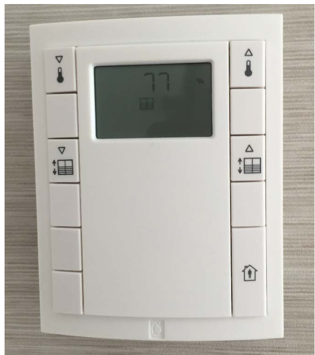
Figure 3. Thermostat and control blinds.