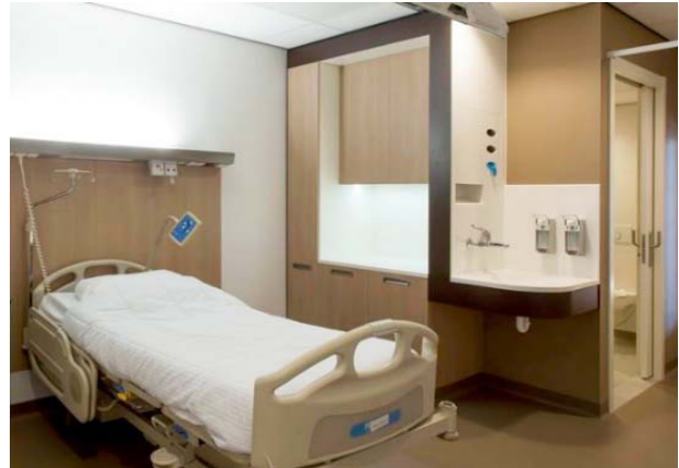
Figure 2. Single bedroom.

bedrooms, the bathroom was accessible from the corridor. Control of temperature, access sunlight and general lighting was possible on building and on room level (Figure 3). In each bedroom, the occupants could decrease or increase the temperature with 2 °C. Blinds between the glass blades provided sun protection. The occupants could lower or raise the blinds, according to their needs. The blinds were available on the east, west and south facades.