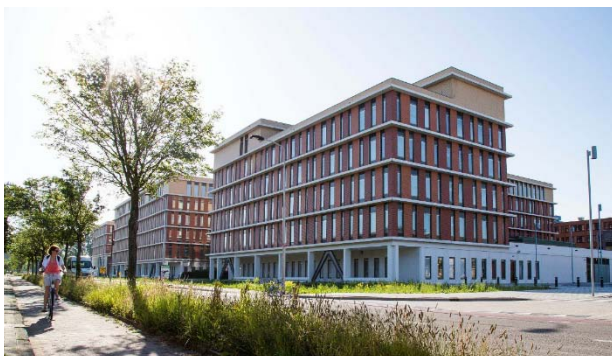
Figure 1. The exterior of the hospital.

The hospital building studied was completed in March 2015 and in use since August 2015 (Figure 1). The building comprised of outpatient and treatment areas and inpatient wards (480 beds). A combination of single bedrooms and shared bedrooms was realized at the inpatient wards on the upper three floor levels of the building. Both types of patient rooms had all sorts of orientation: north, east, south, and west.