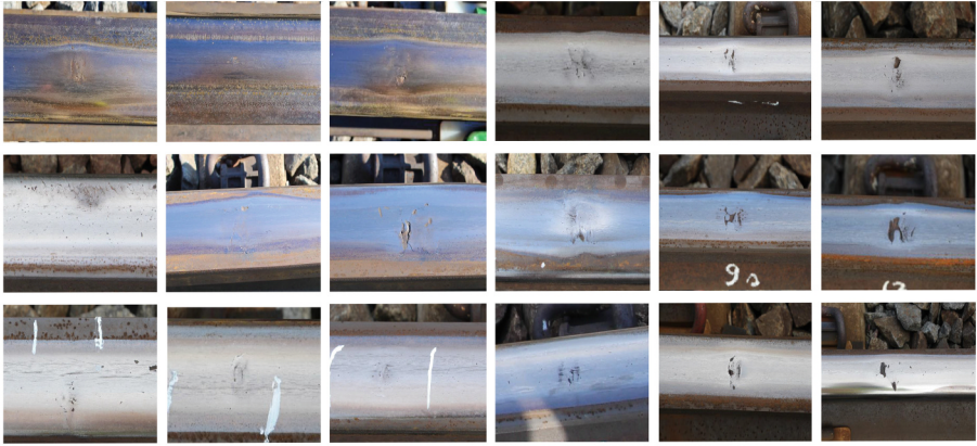
Fig. 2. Photos of some squats and other defects from validated locations.

In the first two locations, a total of eight rail defects were found over a length of over 2 km. At the last three locations, 51 rail defects were found over a length of approximately 1.5 km. These differences occurred because locations 1 and 2 were selected without prior analysis of the ABA measurements, whereas locations 3, 4, and 5 were selected based on the first round of ABA measurements. As the ABA detection method can indicate locations with an impact excitation energy higher than average values with a certain threshold, it detected all insulated joints and some locations of welds and small defects. Healthy welds ideally should remain undetected to the ABA system or exhibit a subtle response. Detected welds suggest an existing deteriorating condition that is typically associated with the presence of rail defects. Thus, to differentiate between faulty welds and rail defects themselves is not required. The ABA method can then be used as an indicator for weld quality control.