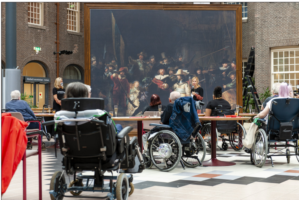
Figure 1 Nachtwacht on tour. Image by Janiek Dam.