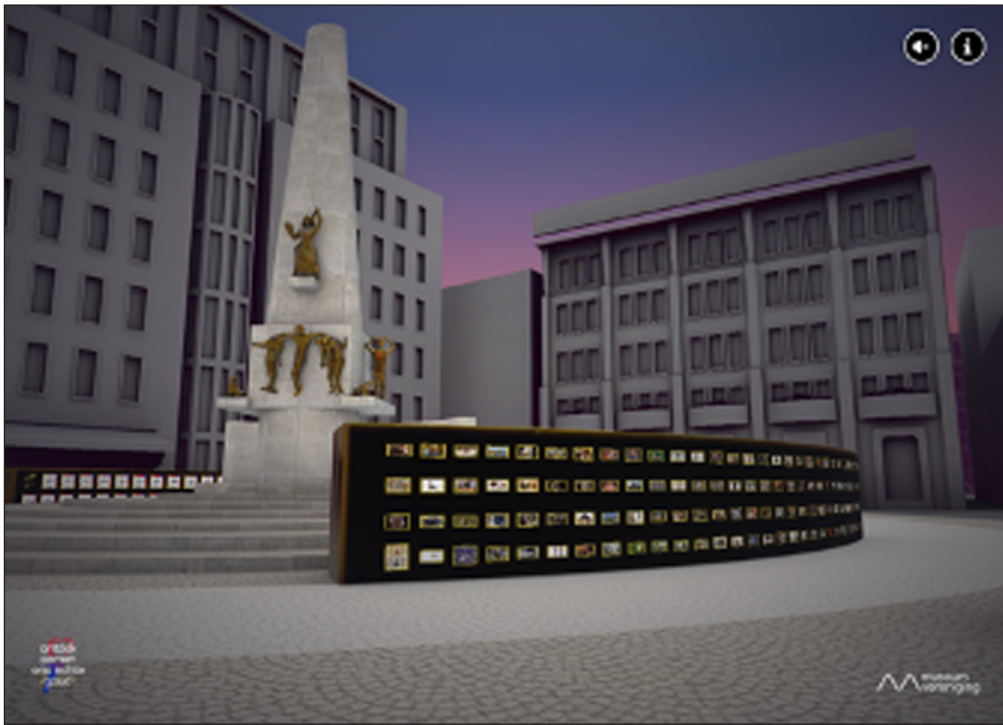
Figure 3 VR-experience of De Dam in Amsterdam with a wall including the interactive and digital programming of 400+ museums in the Netherlands.

artworks is the Instagram page Between Art and Quarantine (Tussen Kunst en Quarantaine) (Officier & Weger 2020). Here, inventors Anneloes Officier en Floor de Weger encourage visitors to dress up as their favorite artworks using 3 household items ( Figure 4 ).