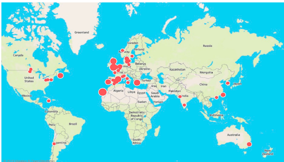
Figure 3. Distribution of the geographical location of the affiliated institutions of the authors. Number of contributions by country: Spain including Canary Islands (13); Greece (6); the United Kingdom (5); Australia and the United States (4); Canada, Norway, Portugal, and Sweden (3 each) France, India, and Italy (2 each); and Belgium, Chile, China, Denmark, South Korea, the Netherlands, Poland, and Taiwan (1 each).

The articles showcase a variety of research methods used ( Table 3 , column 2). The authors of 10 articles conducted literature reviews to summarise policies and problems related to the modal shift, whereas the authors of 11 other articles used surveys and mathematical