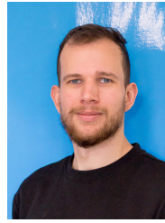
Graduate School of Natural Sciences.