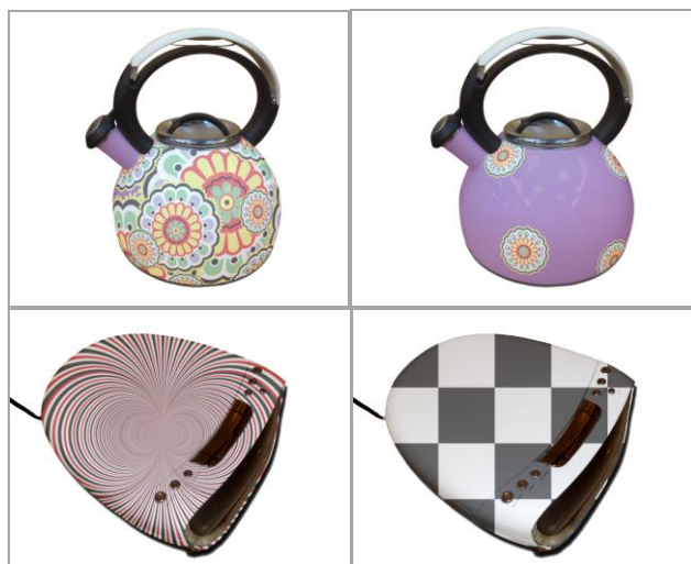
Figure 3. Products (whistling kettles and alarm clocks) used in the experiment on noisiness.

The results demonstrated that the overall experiences of noisiness and annoyance were influenced mainly by the sound for both alarm clocks and kettles, while the contribution of the visual pattern was not significant. For both products we found positive correlations of noisiness with annoyance. The noisiness of the sound had a negative influence on the overall pleasantness of the products.