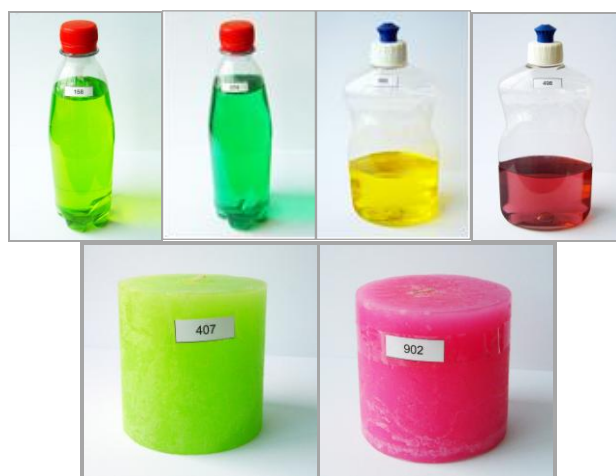
Figure 2. Products (soft drinks, dishwashing liquids, and scented candles) used in the experiment on freshness.

Freshness is important for food products, soft drinks, personal care products and cleaning products. In an experimental study on sensory dominance in the product experience of freshness (Fenko et al., 2009) we created products (soft drinks, dishwashing liquids, and scented candles, see Figure 2) using fresh and non-fresh stimuli (colors and smells) in four different combinations and asked respondents to evaluate the freshness and pleasantness of each product.