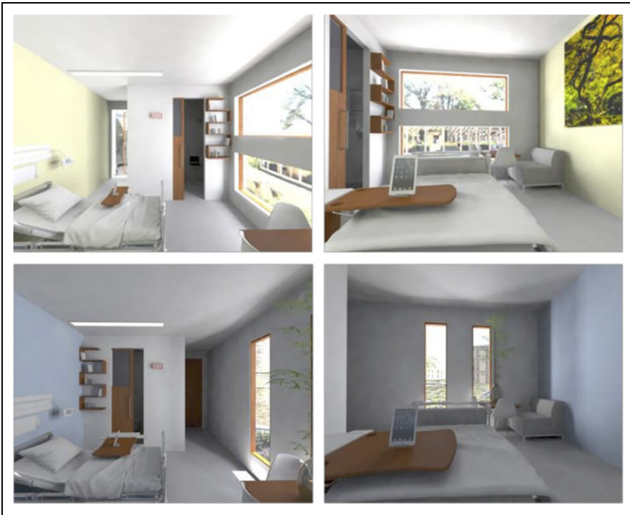
Figure 4. Top row shows the most preferred room according to patients, and the bottom row shows the least.