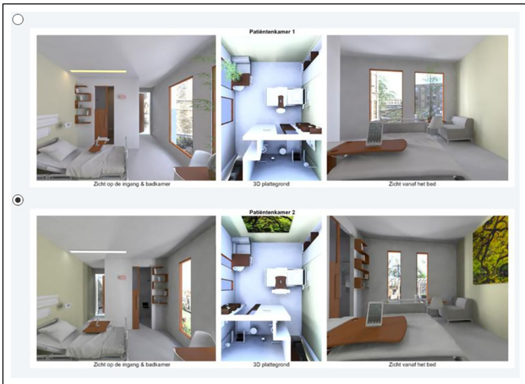
Figure 1. Example 1 of a discrete choice experiment for a (future) patient room. Top row shows a patient room with, for instance, an urban view, a small bedside table, an open wooden door, and the patient being sheltered against a direct view from the hallway (visual privacy). Bottom row shows a patient room with direct view to the hallway (safety), a large bedside table, and narrow instead of wide vertical windows with views to a pergola. The color of the lamps differs: The top row displays warm lighting and the bottom row displays cool lighting.

room. These renderings were then combined in Adobe Premiere Pro.