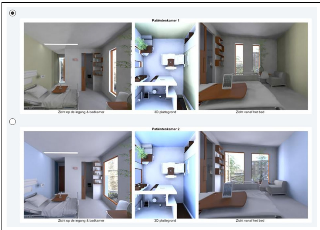
Figure 3. Example 3 of a discrete choice experiment for a (future) patient room. Both alternatives show a patient room with, for instance, an urban view and direct sight lines (no visual privacy) to a wooden door. The door is open in the top row and closed in the bottom row. The bedside table also differs between the two hypothetical patient rooms. The room in the top row has narrow, vertically oriented windows, and the bottom row has wide, vertically oriented windows. Rooms differ also in color (warm vs. cold). Both rooms have cold artificial lighting.

of the social network may not master Dutch, the survey was also made available in English and French. During a stay in France, the survey was also actively promoted near a local hospital by distributing flyers.