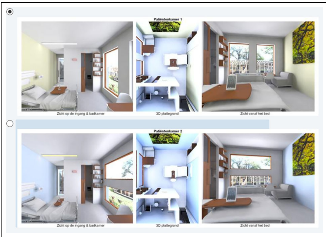
Figure 2. Example 2 of a discrete choice experiment for a (future) patient room. Both alternatives show a patient room with, for instance, a view to a pergola and direct sight lines (no visual privacy) to a transparent door. The door is closed in the top row and open in the bottom row. The bedside table also differs between the two hypothetical patient rooms. The room in the top row has wide vertically oriented windows, and the bottom row shows the more preferred option of a panoramic view.

or worked as medical professionals in the past 10 years. The conditional logit model was used to analyze the choice among the two vignettes (configurations) as a function of the attributes of the alternatives. In SAS, the PHREG procedure was used after preliminary data processing to fit a conditional logit model. The PHREG procedure fits the Cox proportional hazard model to survival data and the partial likelihood of Breslow has the same form as the likelihood in a conditional logit model as Kuhfeld (2010) explains. This model was used to analyze the influence of the attributes. The PHREG procedure uses the Hazard ratio (HR) as an effect measure and Firth corrected 95% confidence intervals (CI) were requested. A threshold of p < .05 was used in significance testing of the main effects. The Multinomial Discrete Choice (MDC) procedure was then used to estimate choice probabilities per attribute