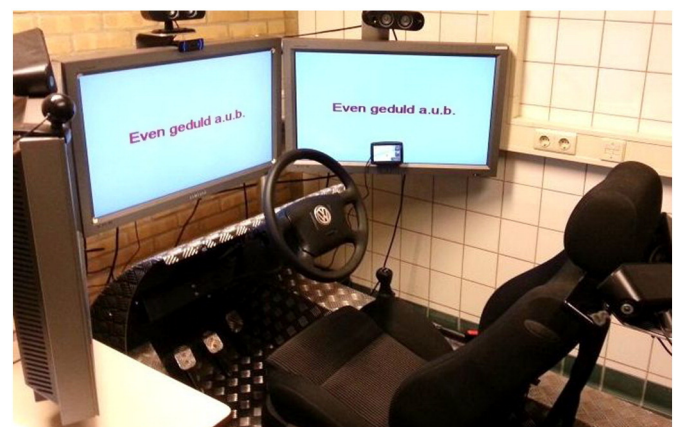
Fig. 1. The driving simulator, with the touch screen navigation system attached to the right hand screen.

Two simulated tracks were implemented that resembled different parts of a 'real' route that was driven in the framework of the EU INTER-ACTION project in the Delft–Leidschendam area. The first track consisted of about 10 km urban area (50 km/h speed limit) and 9 km of motorway (100 km/h limit), while the second track resembled a 10 km interurban road consisting of several speed zones (50, 70, 80, 100 km/h). Road signs, layout and size were simulated as accurately as possible, whereas other surroundings (buildings, trees, etc.) were mimicked more loosely. Other traffic was programmed to drive interactively, resembling off-peak real life traffic density. The first two kilometres of both tracks were used for familiarising participants with driving in the simulator.