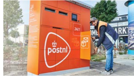
Fig. 2. Example of a Parcel locker

As can be seen in Table 2 the only thing that differs is the height of the lockers; the width and length are exactly the same. The current overall dimensions of the complete parcel locker are, 1610mm x 525mm x 1758mm. The parcel machine has a touchscreen and can be used to draw signatures. A camera is mounted in the locker as well for safety reasons and the machine is reasonably vandal proof. Consumers will receive an email/text when the parcel has arrived in the locker. The machine has a scanner as well, to be able to scan ID's when needed. The maximum storage in this machine is 3 days, where after the parcel will be transported to a nearby retail location.