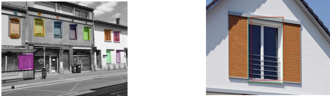
Figure 7. (a) Prediction on a new picture with a lowered output threshold of 0.1 and (b) Illustration of the overlay between the ground-truth bounding box (green) and the predicted one (red).

To get a better understanding of how the detection model performs and the flaws it can have, Figure 7a shows in more details some examples of the predictions made. First, we can see that 7 bounding boxes (classification true positives), were accurately detected on the first floor of the 3 buildings in the picture. However, the map on the bus stop was detected with 66% confidence, which gives a classification false positive. The same happens for the circular ornament above the left most window, which is detected as a window's void with a 54% confidence, and for the rectangular element on the right side of the right most door. In addition, we can see that the model was not able to predict the 2 right most windows, as it only has 22% and 34% confidence, which gives us classification false negatives. On the other hand, on Figure 7b we can see an example of the superposition between the ground-truth bounding box and the predicted one with an IoU of 0.86.