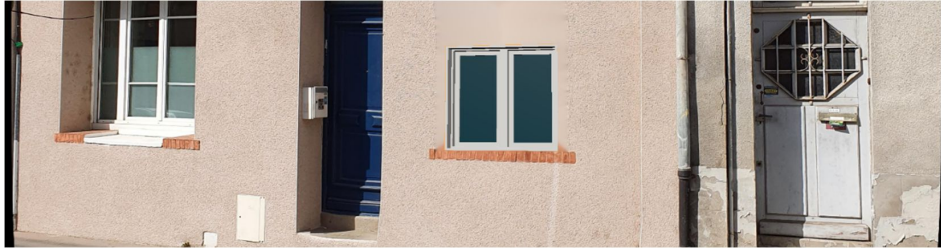
Figure 6. Illustration of the window replacement overlaid on top of the original image. Inpainting artefacts are visible near the windowsill. Lighting of the window frame has been manually adjusted.