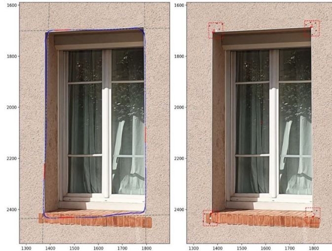
Figure 4. Illustration of the detection mask clean-up process with on the left in blue the original mask, in red the four tangents that explain most mask vertices, their extension in gray. On the right the intersection of these extensions is displayed in white with a search area around them in which several Harris corners are identified, in bright red the closest to the search area center is indicated, which is selected and indeed corresponds to the corner of the actual window void.

This is purely a geometric method that disregards information from the image pixels. For that reason, we create a neighborhood around the four window corners and use the Harris (Harris & Stephens, 1988) points in the OpenCV computer graphics library to “snap” the geometrically constructed points back to strong corners in the image. This is illustrated in Figure 4.