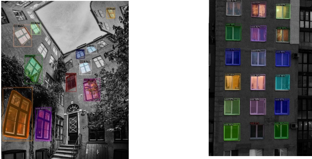
Figure 2. Illustrations of the windows voids detected on unseen new data. The model is able to detect windows different shape and from different angles.

We made the choice to label the voids instead of the windows objects because we need the void corners to create the extrusion in the wall.