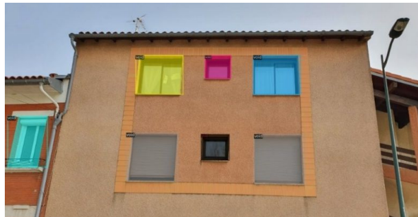
Figure 1. Annotated picture with bounding box and mask for every window void

Detectron2 enables to use pretrained models that were trained on thousands of images. Thanks to this transfer of learning, we can train our model with only hundreds of examples. This lower the barrier to using machine learning algorithms by reducing the data acquisition effort, the labeling effort, and without requiring the use of powerful hardware. While the model was trained on different objects than windows voids, the model learned how to characterize patterns