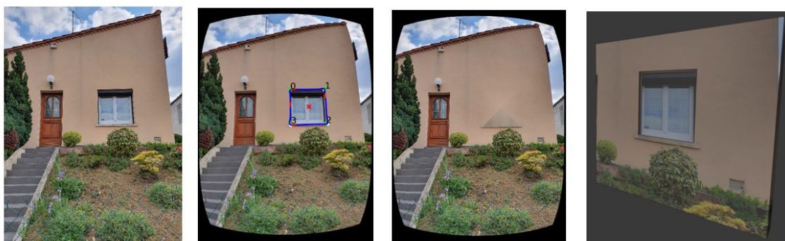
Figure 3. Visualization of the reconstruction pipeline final and intermediate results.

The 3D reconstruction used in our research depends on a correspondence between 2D points on the image and 3D points in BIM. Detectron2 gives us a region mask with arbitrary shape and even for a detected quadrilateral will be somewhat irregular at the edges. Therefore, at every point of the polygon mask we create an infinite line along the principal component direction fitted through 100 neighboring points. We pick the rays that explain most points, and keep their intersection points, which in case of conventional windows yields a two-dimensional quadrilateral.