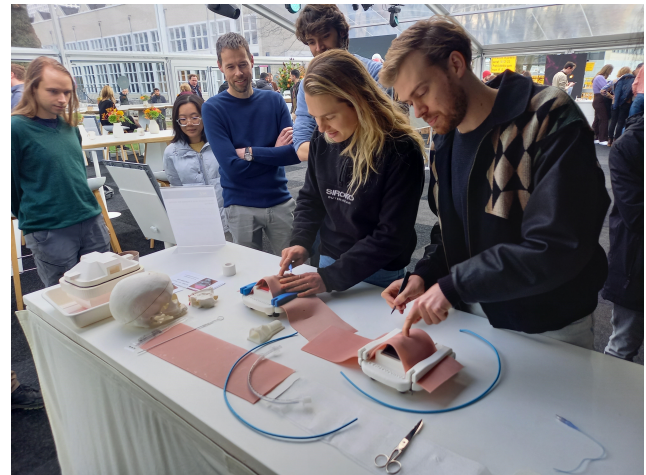
Figure 3: Overview of the demo setting, in which participants can safely perform an incision using our proposed phantom larynx setup.

opening between the larynx and the trachea (blue area in Figure 1) has to be located.