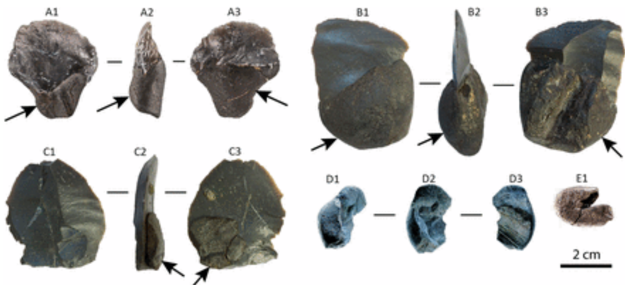
Fig. 1 Images of all securely identified MP birch tar finds. A) Zandmotor, B and C) Campitello flakes, D) Königsau A, E) Königsau B (Zandmotor image: Frans de Vries/ToonBeeld, the Netherlands; Campitello images: Museum of Natural History, Università di Firenze, Italy: Specimen IGF 17520; Königsau images: Landesamt für Denkmalpflege und Archäologie Sachsen-Anhalt, Germany.

We report the analysis of a flint flake embedded in a thick black residue discovered on the Zandmotor North Sea beach nourishment near The Hague, The Netherlands (Fig. 1A and SI Appendix, Fig. S1). The find has the same geological provenance as a Neandertal fossil discovered in 2009 (1). A direct accelerator mass spectrometry (AMS) radiocarbon date of ~50 ka cal BP confirms its Marine Isotope Stage (MIS) 3 Middle Paleolithic (MP) origin. Additional chemical analysis revealed that the flake was hafted with birch bark tar. As only 2 other MP sites have yielded chemically confirmed birch tar, the Zandmotor discovery represents a major increase in the number of Neandertal tar samples.