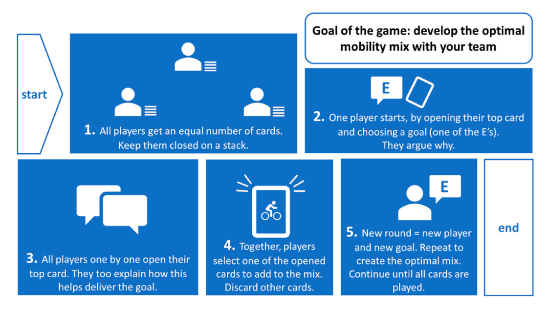
Fig. 4. Rules of the game presented in a scheme.

The game participants have to imagine being in charge of the mobility system for a predefined case study area (e.g. a city or region) in a specific moment in time (e.g. today or in 2040). They have to decide in their group what they consider the most important goals of the total transport system for their case and what optimal mix of vehicles they want to facilitate/stimulate to achieve these goals. The game encourages them to discuss both these goals and modes and forces them to make decisions together. Doing this, the game participants are provided with an opportunity to learn about (each other's) arguments and assumed impacts regarding societal goals and modes. Such learning could support them in the process of dealing with multiple perspectives, objectives and multimodal solutions.