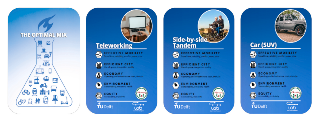
Fig. 3. Different cards in the game. See appendix A for an overview of all included modes.

The goal of the game is to support learning through discussing, exploring and informing policymakers and (future) professionals about the potential wider goals of transport systems, as well as the potential contribution of (emerging) modes and services. Based on