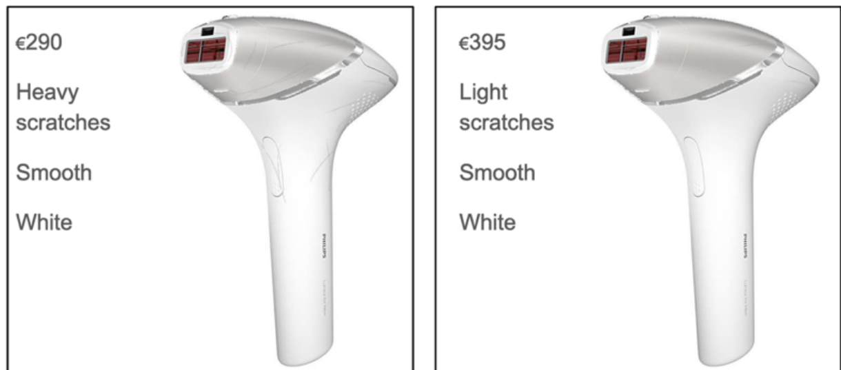
Figure 2. Example scenario with a white IPL device with heavy wear-and-tear (left) and one with light wear-and-tear (right)

The participants were first interviewed on their general choice for the IPL device and why they chose it in a new, second-hand or refurbished. Furthermore, product state of the IPL device (e.g. “Can you describe the condition of the product at its arrival?”), the first product use (“Can you describe your first use experience?”), product characteristics (“Can you describe the appearance of the product?”), and why they did or did not choose a refurbished one (e.g. “What made you decide to buy a refurbished device over a new one?”) were discussed. Second, all participants were shown six scenarios consisting of images of two refurbished IPL devices side by side. The two options differed in color (black or white), material (smooth or rubber), amount (light or heavy wear-and-tear) and location of wear-and-tear (on housing or on buttons or attachment) and price (290-450€; for an example, see Figure 2 and for all scenarios Table 2). The images were created in Adobe photoshop and were used to stimulate the imagination of buying a refurbished Lumea with different features. We explained that these products were refurbished, after which participants were asked which one, they would buy and to explain why. Participants received a small compensation (10 euros voucher) for their participation in the 30-40 minutes long study. The study was approved by the Human Research Ethics Committee of the Delft University of Technology.