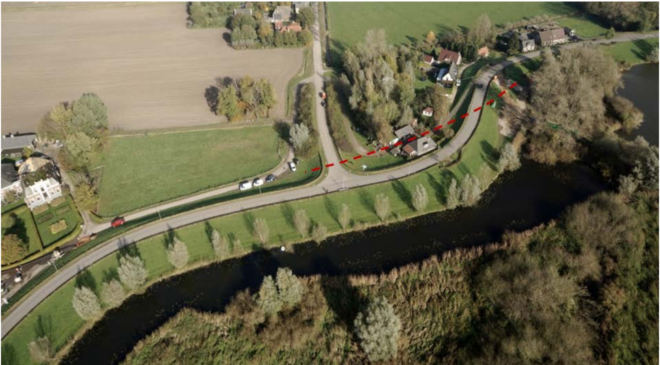
Figure 2. Alignment of controllable drainage tube near Veessen

The vertically inserted geotextile has been applied at four different locations in the main dike along the Lek river between Hagestein and Opheusden in the Netherlands. These sections have lengths of 100 to 500 meters (Förster et al., 2015). Field tests have been carried out at a dike of secondary importance to investigate various failure mechanisms associated with this solution (Koelewijn et al., 2017a). Two other applications are in preparation, as well as large-scale tests to determine the critical head of this system.