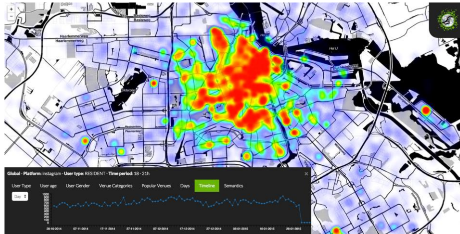
[a] ALF – Platform: Instagram | User type: Resident | Time Period: 18–21h