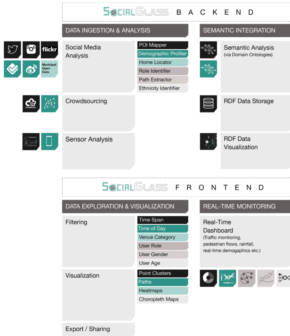
Fig. 1. System architecture of the SocialGlass platform

Semantic Enrichment and Integration component. This component simplifies the interconnections among the different data sources and providers. It specifically caters for tackling the several syntactic and semantic (spatial, temporal, and thematic) heterogeneities of the ingested data. To this end, it adopts Semantic Web technologies and Linked Data principles, by