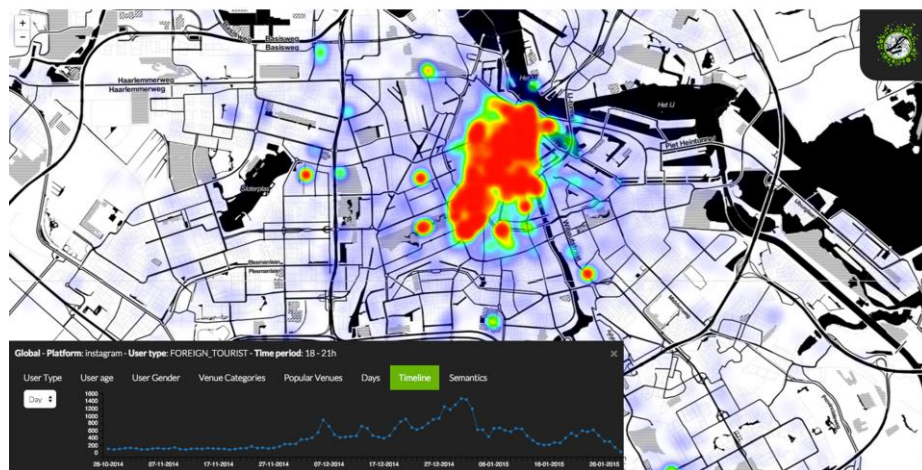
[b] ALF – Platform: Instagram | User type: Foreign Tourist | Time Period: 18–21h

Fig. 2. Activity heat maps of the ALF, illustrating the average spatial distribution of (a) Residents , and (b) Foreign Tourists , from 6pm till 9pm during the entire event period, based on their Instagram posts. In the Timeline we observe that Residents ' activity is rather balanced, while Foreign Tourists present significant fluctuations, especially around the holiday season. In addition, Foreign Tourists appear to gather at popular venues, while Residents ' activity is more spatially dispersed.