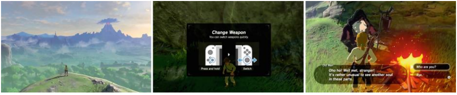
Fig. 1. In Zelda: BotW [32] the player's attention frequently shifts between, e.g., affective (a beautiful vista), gameplay (learning controls), and social (meeting an NPC).

energy in. Mechanics that are deep enough, however, can maintain attention for a long time. Narratives and characters neither capture nor hold attention very well; while people are drawn to them, it is challenging to write them in a way that are both quickly understood and remain interesting [1]. Finally, elements aiming at affective involvement capture attention well (e.g., through art style, music, and sound design), but are less likely to hold attention unless the game offers other elements of substance.