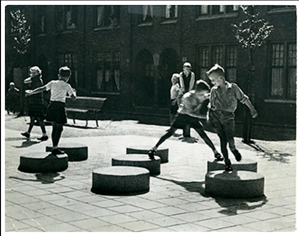
Image 1. Aldo van Eyck, playground Zaanhof, Amsterdam 1948, photo by Wim Brusse, copyrights Aldo van Eyck Archive, Loenen.

Bakema developed this idea of a socio-material relationship for architecture at the Congrès Internationaux d'Architecture Moderne (CIAM) conferences, especially the one of 1951, which was devoted to the reconstruction of the war-damaged cities of post-war Europe. Bakema's contribution was titled 'Relationship between Men and Things'. Implicitly referring to De Stijl and Piet Mondriaan he stated, 'Everyday we discover that the only thing that exists is relationships' (Bakema, 1952).