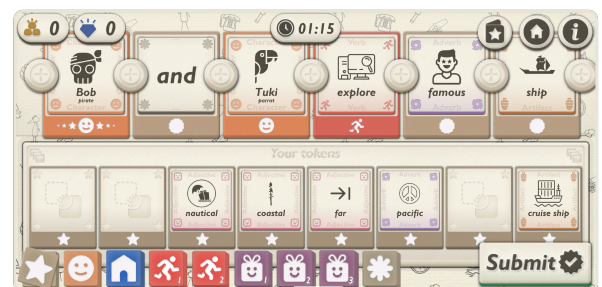
Figure 1: TaleMaker sentence composition: players create a plot point by dragging and dropping tokens from their collection (below) into the appropriate slots (above).

FDG '22, September 5–8, 2022, Athens, Greece © 2022 Copyright held by the owner/author(s). ACM ISBN 978-1-4503-9795-7/22/09. https://doi.org/10.1145/3555858.3555910