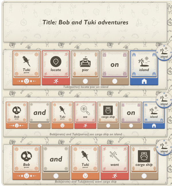
Figure 2: Visual story retrieved from TaleMaker's database of stories.

the story, the process is repeated by another player, who introduces two new characters and a new location.