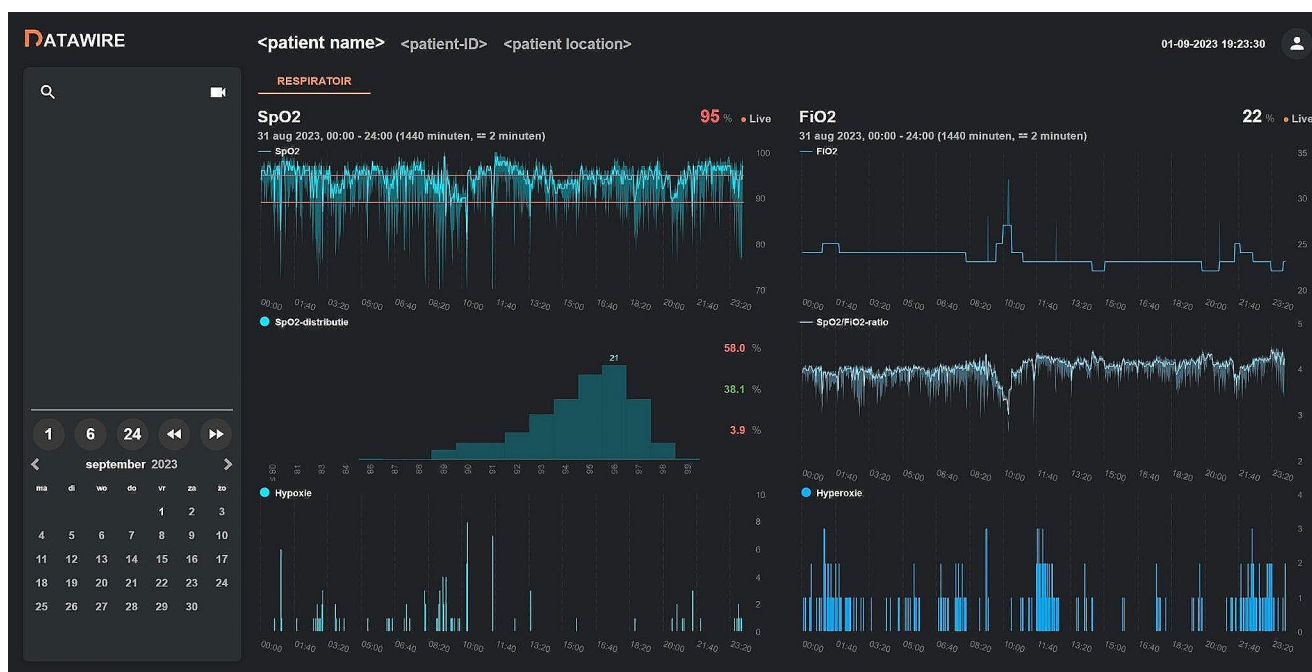
Fig. 3 Prototype of the dashboard that was evaluated during clinical rounds. The prototype presents 24 h of anonymized data from a patient admitted to the neonatal intensive care unit, including data on the SpO 2 (top graph left), SpO 2 distribution (middle graph left), area <80% SpO 2 curve (defined as hypoxia - bottom graph left), FiO 2 (top graph right), SpO 2 /FiO 2 ratio (middle graph right), and area >95% SpO 2 curve (defined as hyperoxia - bottom graph right). The left column presents normally an overview of the admitted infants and a calendar to select a day and a certain time interval (1, 6, or 24 h). The figure

presents that around 8:00 the median of the SpO 2 decreased to below the clinical lower SpO 2 limit of 89%, without an increase in FiO 2 for almost 2 h. Other timeframes, especially before 3:00 and after 21:00, show median SpO 2 levels above the upper SpO 2 limit of 95% with a FiO 2 that remains above 21%. Real-time availability of this information would possibly result in improved titration of the FiO 2 to avoid SpO 2 levels outside the clinical target limits, although this is a retrospective evaluation that could have been influenced by other factors as well. SpO 2 : oxygen saturation; FiO 2 : fraction of inspired oxygen