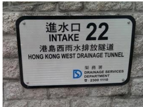
Fig.1 Hong Kong West Drainage Tunnel stretching over 11km, designed to alleviate flood risk in the North of Hong Kong Island.

Since the 2000s, Guangzhou has witnessed a fast urban sprawl, which stretched its development into flood prone areas (Dąbrowski et al., 2021), in line with the ‘planning for growth’ paradigm (Wu, 2015), as illustrated by the development of the Nansha district as the new economic and port hub on the seafront. However, the development of drainage infrastructure is much slower than the urban expansion and surface hardening processes. As a result, waterlogging in case of heavy rainfall bringing the city to a halt is increasingly a common problem. In 2014 the city government produced a white paper on water management recognising the need to adapt to climate change.