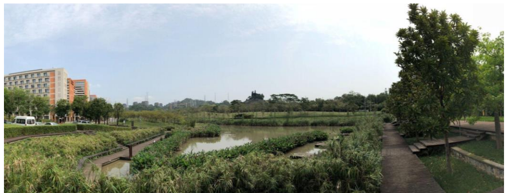
Fig.3 Daguan wetland park in Tianhe District under the Sponge City Programme

“Bluebelt Construction Master Plan of Guangzhou”, launched in 2020, also helps to enhance the urban capacity of flood resistance. It was launched in response to a provincial call and led by the water management sector, focusing on on the combined benefits of green and water ecosystems along canals and river banks, which proposes to recover buried waterways, improve waterfront landscape and accessibility, purify polluted water, and reinforce dyke systems.