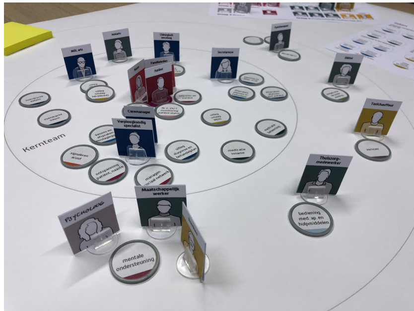
Figure 2 Co-design tool for the layer Companions, with an inner circle including the patient and his/her significant other at the centre and the other people involved on a regular basis, and an outer circle with people who may ad hoc be drawn in, for example, a dietitian, a psychologist.