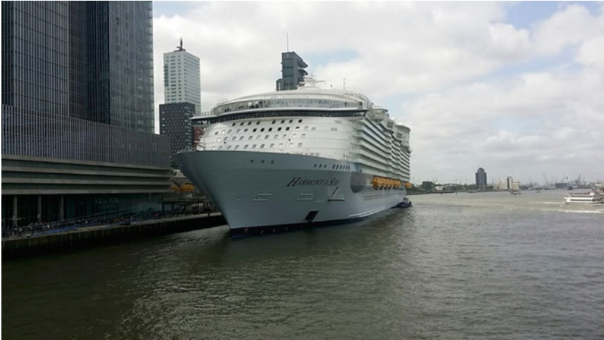
Fig. 5 Arrival of the Harmony of the Seas (the second largest passenger ship in the world) into the cruise terminal Rotterdam on 24 May 2016, credit Arash Salek; released under a Creative Commons Attribution-NonCommercial-NoDerivatives 4.0 International Licence