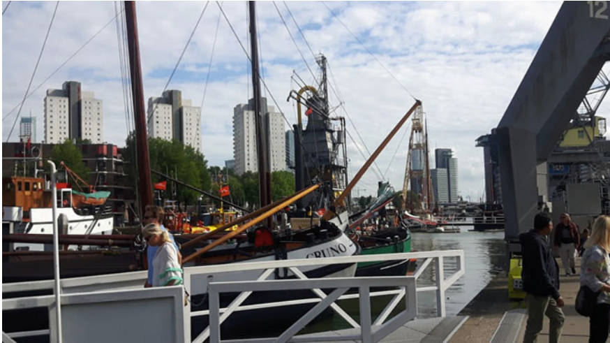
Fig. 2 Rotterdam Leuvehaven, 2017