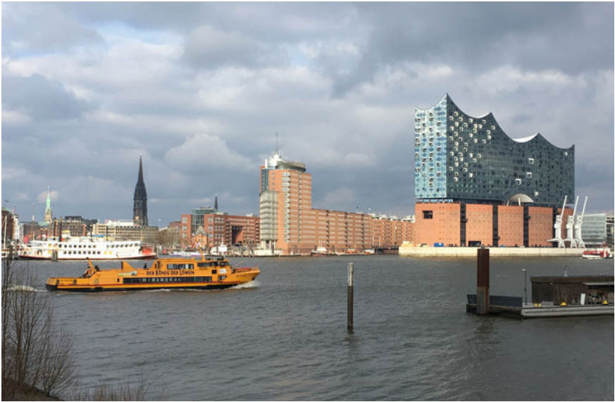
The HafenCity Hamburg, Germany with the Elbphilharmonie, 2018