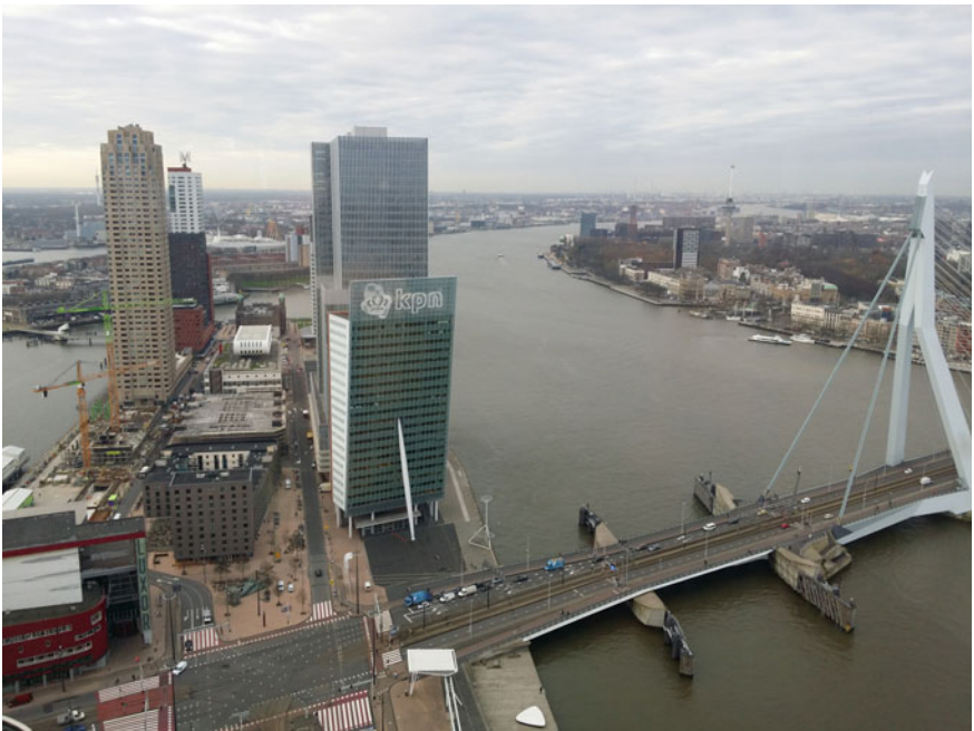
Fig. 3 View towards Kop van Zuid and the Erasmus bridge, credit Arash Salek; released under a Creative Commons Attribution-NonCommercial-NoDerivatives 4.0 International Licence