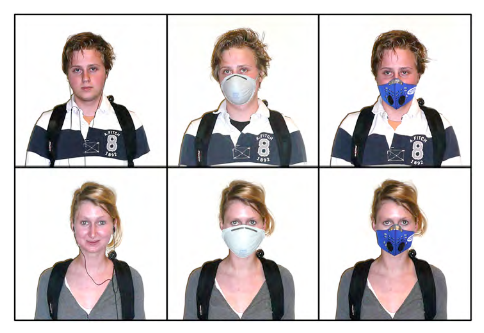
Figure 1 Male and female confederate in the three conditions