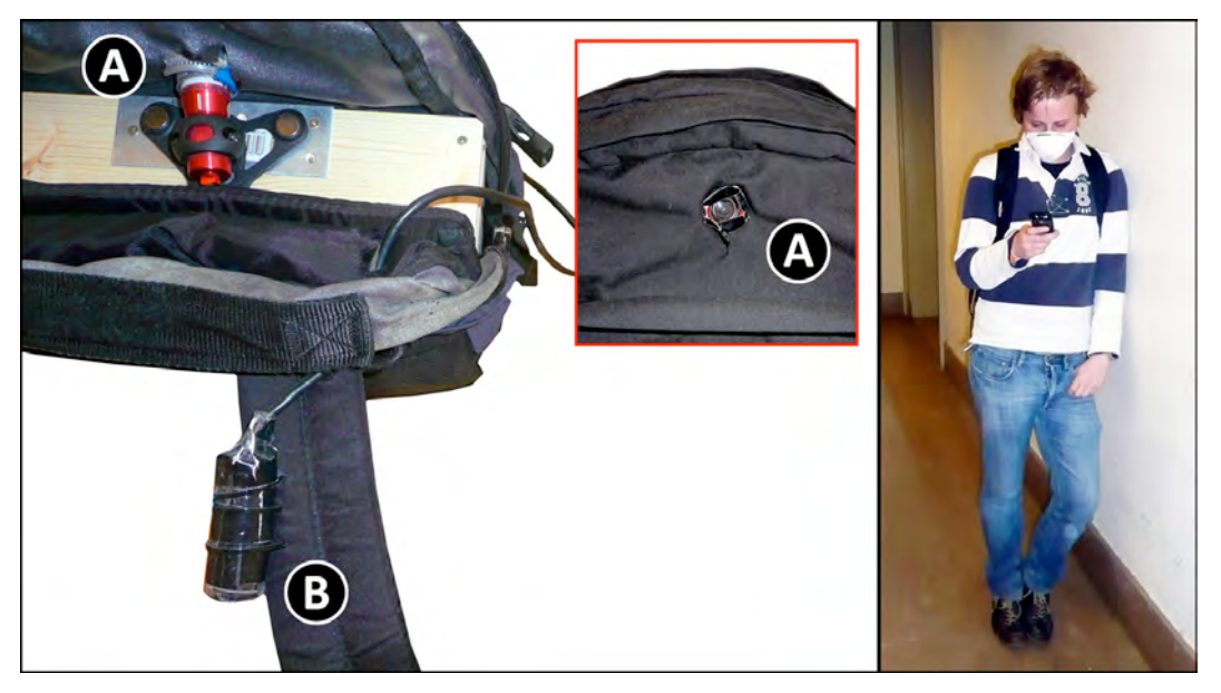
Figure 3 Build-up of the Spy-Pack backpack / confederate wearing Spy-Pack

All 6 conditions were filmed in full sequence. To allow synchronization of the 5 videoimages, an audio signal was incorporated at the start of the recordings. Above the research confederate, five Sanyo Xacti HD cameras were installed and in the backpack (Spy-Pack) two VIO POV wide-angle HD cameras were build in. Figure 3 shows how both cameras were integrated in the Spy-Pack. The five images from the overhead cameras were 'stitched' and carefully aligned in Adobe Premiere.