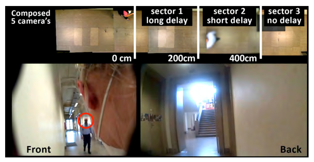
Figure 4 Variable 1 – Staring behavior: no delay, short delay or long delay

delay. If the passer-by did not visibly look towards our confederate, within any of these three areas, we encoded this person's perception as 0. This measure was derived by analyzing the frontal video image of the Spy-Pack on a large screen, combined with the composed image of the overhead cameras. Passers-by that clearly turned their head towards our confederate or stared into the camera mounted on the confederates' shoulder were considered as valid participants. When a clear visual detection of the passer-by was observed on the frontal camera, the image was paused and the correspondent sector was indicated with the appropriate statistical value: 0 (no visual perception), 1 (sector 1/long delayed perception), 2 (sector 2 /shortly delayed perception), 3 (sector 3/no delay or immediate perception). In Figure 4 a passer-by noticed our confederate in sector 2, with a short delay.