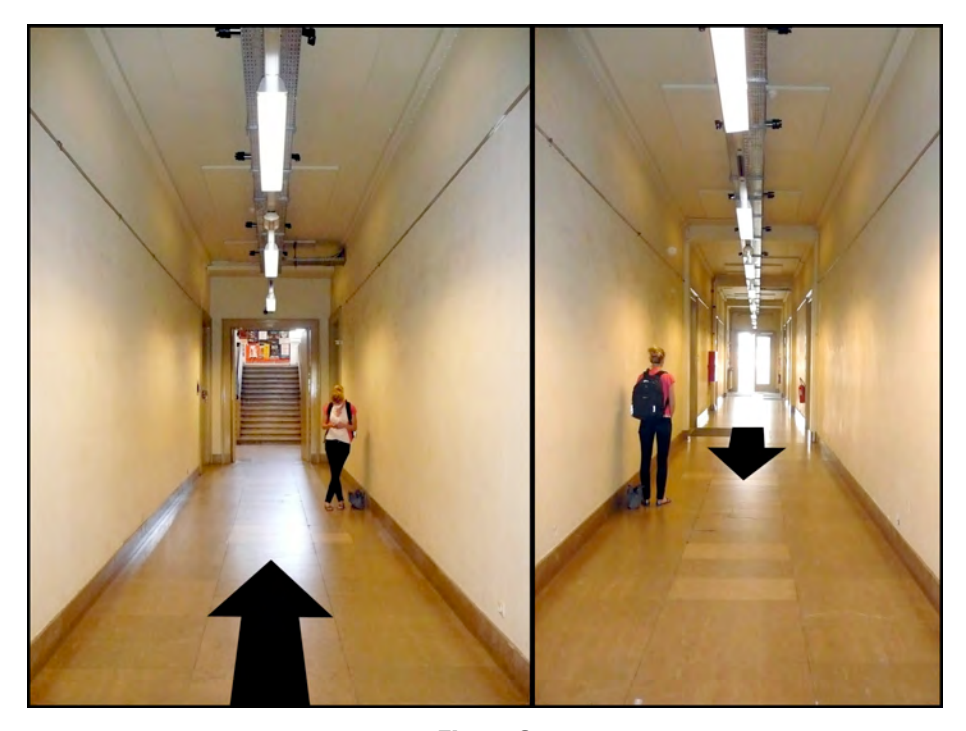
Figure 2 The hall in which the experiment was set up

The experiment was set up in a spacious hall with no visual or physical obstructions. The hall had a length of 20m and a width of 2,7m. The confederate was placed, leaning against the wall, at a distance of 12m from the entrance. Five overhead cameras were positioned in a lighting rail, 4m above the confederate. To avoid distortion we made sure that there was enough overlap between the video images of the overhead cameras. Combining the five images enabled us to monitor the passers-by over a distance of 15m, 10m before and 5m after passing the research confederate. Prior to the actual experiment we interrogated 35 passers-by and asked them whether they had noticed anything unusual in the empty hallway; none of them reported noticing the overhead cameras.