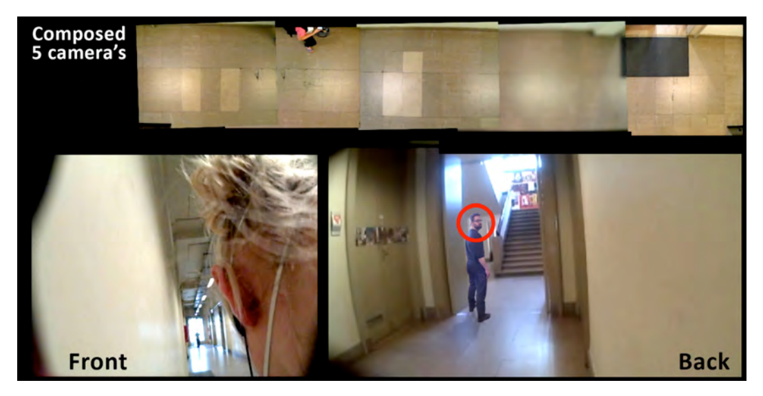
Figure 5 Variable 2 – Staring behavior: a passer-by looking over his shoulder

Variable 2 – Staring behavior / Looking back: This variable is an indication of enhanced staring behavior and was derived from the images of the rear camera in our Spy-Pack. Displayed on a large screen, these images enabled us to detect whether people looked over their shoulder or stared into the rear camera. This parameter was transformed into a 0 (no looking back) or a 1 (looking back behavior). No attention was given to the relative position of the passer-by towards our confederate on the moment of looking back.