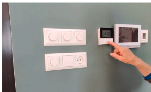
Fig. 5. Ella’s interactions with the thermostat.

In summary, reconfigurations happening in the home are both embedded in, and triggered by professional practices. Professional and local household expertise come together to shape these ‘innovations-in-waiting’.