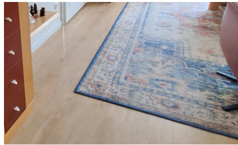
Fig. 3. Louise's rug that softens the room.