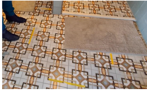
Fig. 6. Ella's bathroom floor markings indicate where the floor gets warm and where it does not.