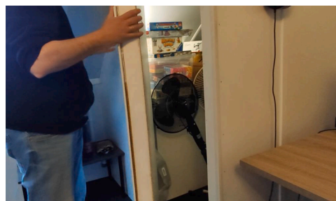
Fig. 2. Rudolph shows the sound insulation that reduces the noise from the ventilation system.

Beyond the expected routines required for making the heat pump work (such as turning up the thermostat when it gets cold), we found other reconfigurations of routines. We observed how they relate to previous arrangements of routines, and how they might be new or shared.