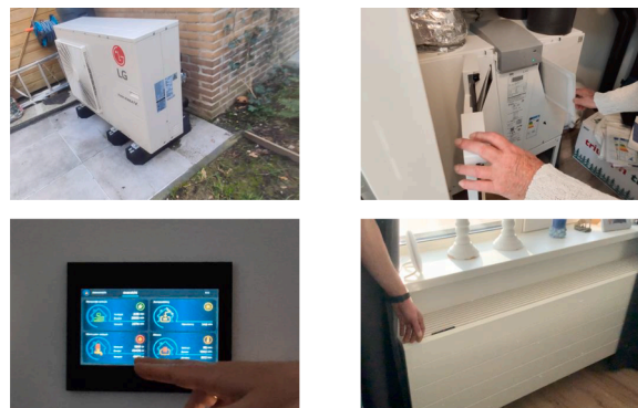
Fig. 1. An impression of the participating homes (Left to right, top to bottom: an air-to-water heat pump, air filters being replaced, a display showing domestic hot water consumption and budget, low-temperature heating convectors).

The research consisted of ethnographic site visits to eleven households across the Netherlands (Table 1). Nine of these households were renters and were invited to participate through contacts at social housing and rental organizations. Two were owner-occupied and were recruited through word-of-mouth in the researchers’ social environment. The sample balances older and younger people, couples, families, and single dwellers. The buildings are both apartments and terraced houses. The sample of participants and building