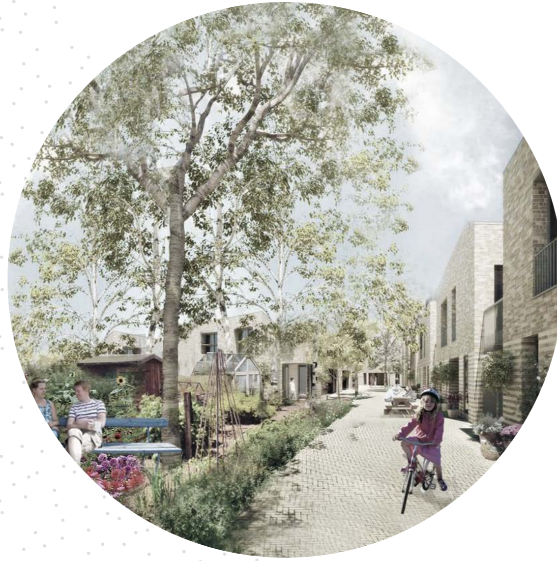
+ An impression of an allotment cluster with a linear structure

A phased plan is developed for each area to show its flexibility for the future. Finally, the design of the green structure on a bigger scale along the Rhine and its green fingers, is connecting the different parts of the area.