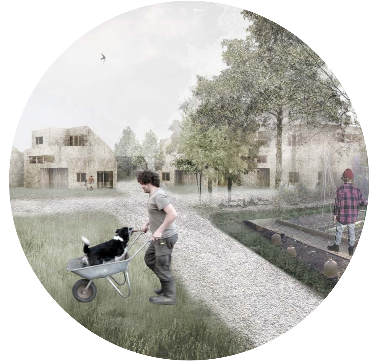
+ An impression of an allotment cluster with a structure built along axes with a collective space