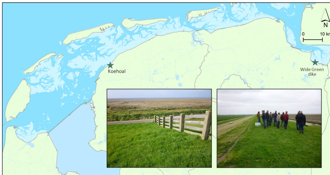
Fig. 3 Locations and pictures of the Mud Motor Koehoal (left) and Wide Green Dike (right) nature-based adaptation innovations along the Wadden Sea coast

by dikes. The Wadden Sea is a shallow sea, marked by barrier islands, sand and mud flats and coastal marshes (Reise et al. 2010). Due to its outstanding nature values the Wadden Sea has been listed as a UNESCO World Heritage site since 2009 (CWSS 2008; UNESCO 2009), and is protected by both national and international regulations for nature conservation. In 2010 a process commenced to search for suitable and sustainable adaptation strategies under future sea level rise (van Alphen 2016). Hybrid solutions that include the natural and semi-natural salt marshes along the Wadden Sea in dike design were seen as especially promising (Delta Programme 2014). These salt marshes function as a natural flood defence in front of the dike by damping incoming waves and reduce wave energy via friction with vegetation and the marsh surface (e.g. Anderson and Smith 2014). This has positive implications for the required dike dimensions (in particular slope and height) and the need for slope and toe protection structures (e.g. hard revetments and rocks) (Van Loon-Steensma 2015). Furthermore, natural and semi-natural salt marshes provide valuable habitat for characteristic salt-marsh vegetation (see e.g. Adam 1990), birds, fish and several invertebrate species (Bakker et al. 2005). Both our adaptations are large-scale nature-based flood protection innovations and focus on the development of salt-marsh foreshores and natural processes in view of future flood protection.