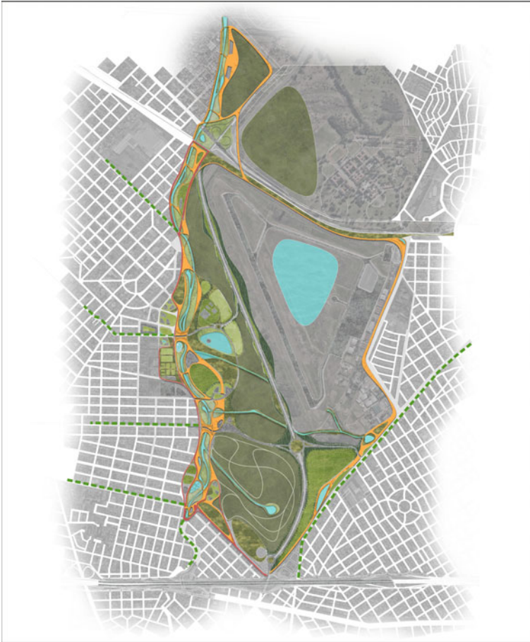
Fig. 11.2 River project with a strategy for socioeconomic transformation. Morón River area. Drawing by Sofia Videla, Agustina Cuoco, Valentina Gertiser

urban projects conceived as static architectural forms. Instead, it shapes them as dynamic transformations or journey forms. 14 In this understanding of design, the radical rootedness of a project refers to the etymology of the term “root,” deriving from the Latin word “radix,” generating the adjective “radical.” It distinguishes itself from “radicant,” used in botany to discern plants like ivy that grow secondary roots, plants that do not anchor in one particular place but react to whatever conditions arise, in a never-ending process. These plants develop through enrootings (a verb in gerund, dynamic), not based on a single root (a noun, static).