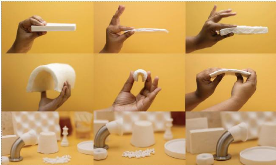
image / figure 2 Foamlab's bacterial cellulose foams