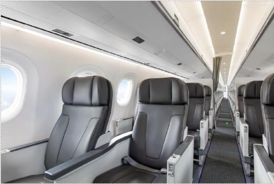
image / figure 1 Embraer E195 E2 interior

introduction (continued): space for images