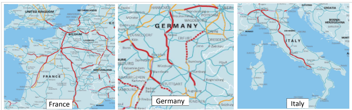
Figure 1 Simplifies spatial configuration of HSR networks in particular European countries (Crozet,2013; http://www.johomaps.com/eu/europehighspeed.html )

The spatial configuration of the HSR networks is generally the country specific. Figure 1 shows examples for some European countries