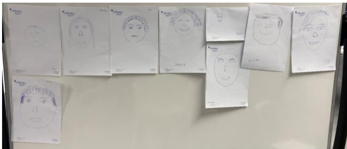
Figure 1. Collaborative drawing used as ice-breaking activity.

With regard to Tallinn , a co-creation approach has been used in Estonia's public sector for at least five years, with several instructional materials created. This approach supports bottom-up discussions and solutions, encourages a diversity of opinions, enhances effective cooperation between parties, and enables mutual learning. It served as an important source of inspiration for the Tallinn co-creation process.