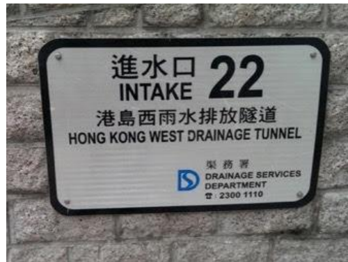
Fig.1 Hong Kong West Drainage Tunnel stretching over 11km, designed to alleviate flood risk in the North of Hong Kong Island.

Since the 2000s, Guangzhou has witnessed a fast urban sprawl, which stretched its development into flood prone areas (Dąbrowski et al., 2021), in line with the ‘planning for growth’ paradigm (Wu, 2015), as illustrated by the development of the Nansha district as the new economic and port hub on the seafront. However, the development of drainage infrastructure is much slower than the urban expansion and surface hardening processes. As a result, waterlogging in case of heavy rainfall bringing the city to a halt is increasingly a common problem. In 2014 the city government produced a white paper on water management recognising the need to adapt to climate change.