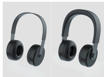
Figure 1. Example stimuli of breakable (slender/breakable) and solid/durable (right) headphones used in this study.

In a within-subjects design, we exposed 76 participants with experience in design (48 females; age range: 20-59, M=26.5; years of design experience: 1-35 years, M=6.14) to six blenders and six headphones. Participants rated all stimuli on several 7-point scales (see appendices ). The pre-test results demonstrated that the stimuli significantly varied in attractiveness (Bell et al., 1991) and durability (Mugge, Dahl, & Schoormans, 2018) (all p 's <.05). Furthermore, the stimuli had a similar level of performance quality and ease of use (Grewal et al., 1998; Mugge et al., 2018) (all p 's >.05) to rule out that these factors would have an additional effect on our findings (see appendices ).